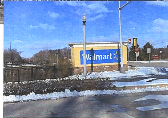
current onsite signage for Walmart