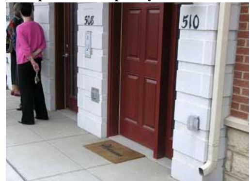
Example of a no-step entry

(f) Minimum building separation. Dwelling units shall maintain a minimum separation of 10 feet.