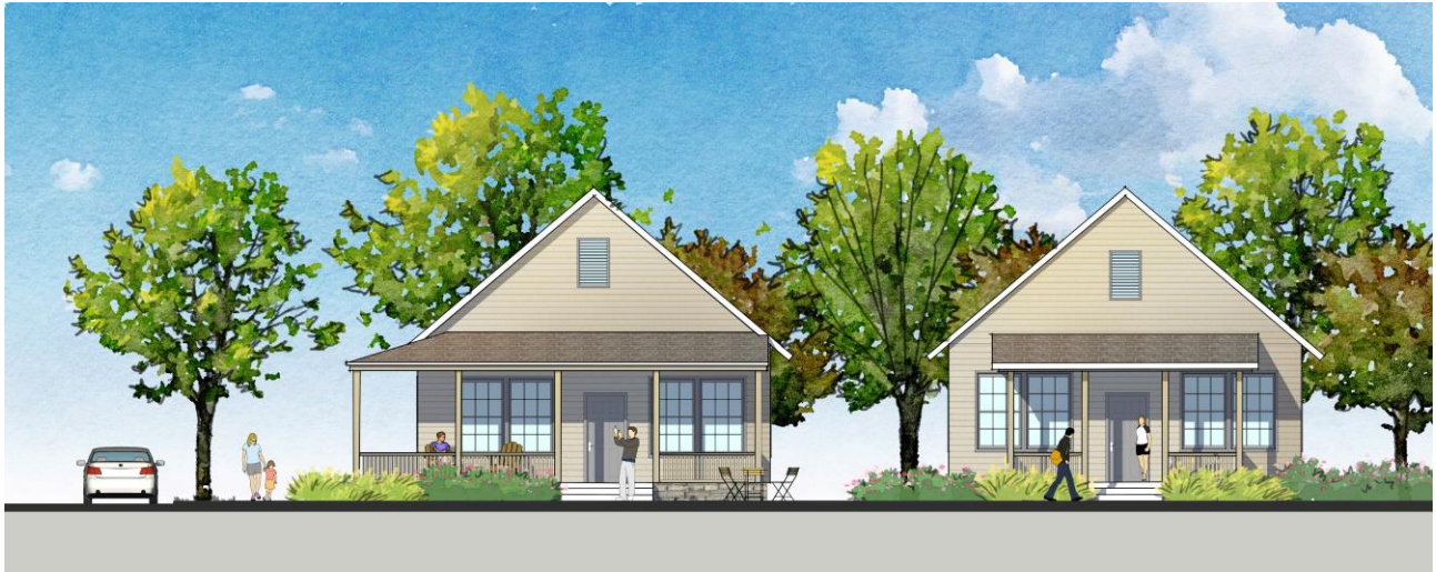
© Civic Webware | Not to scale